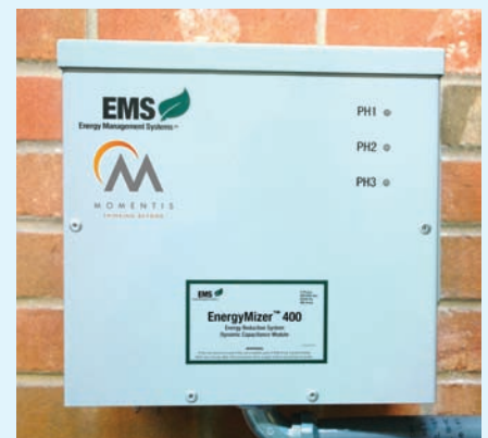
EnergyMizer® 400 Dynamic Capacitance Module